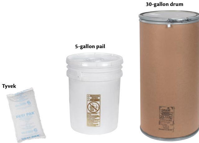
Priced per Package

Dust-free: Tyvek bags are ideal for applications where dust must be kept to a minimum. Examples include computer components, packaged chemicals, and photographic and optical devices.